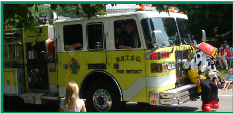
Many of BST&G Fire District's fire engines, other equipment, and mascot were showcased in the parade.