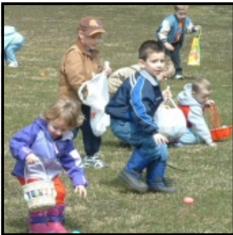
Children race to find eggs at Galena's annual Easter Egg Hunt on March 26.